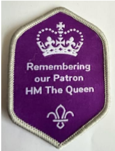
Remembering The Queen