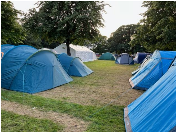
Our District Camp set up!