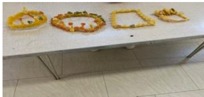
Coronation Crowns made with Pasta