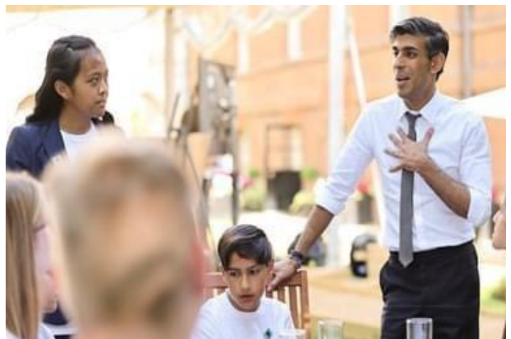
Nung – It's amazing who she meets!