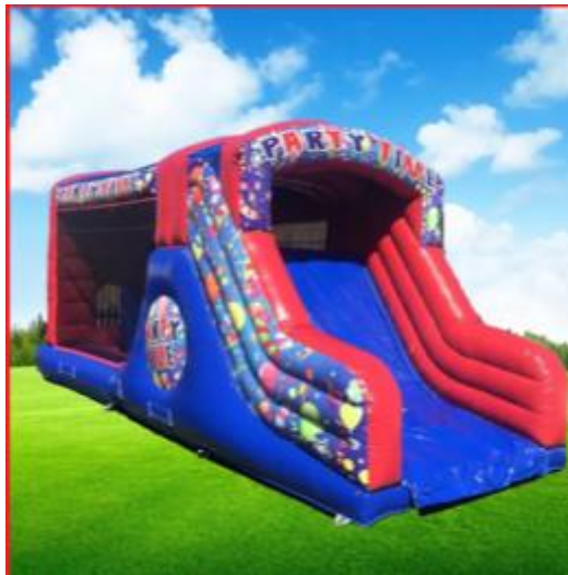
AGM Party Time as promised!