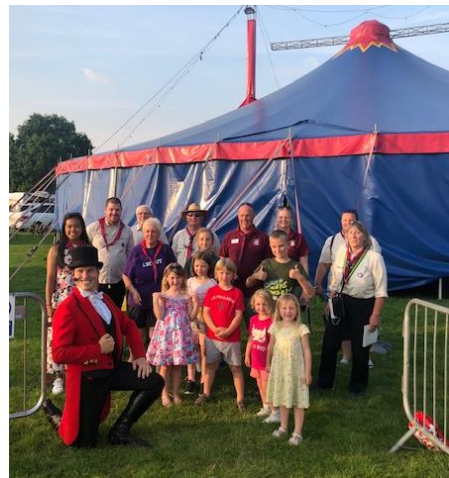
Group visit to the Circus!