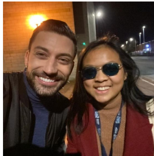
Nung – It's amazing who she meets!