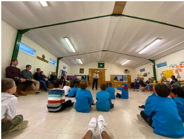
Starting back up after lockdown!