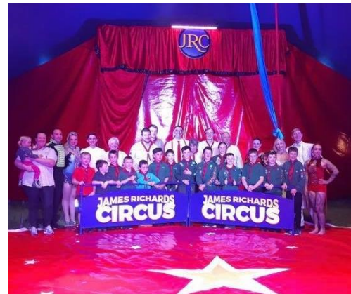
Members of the Group enjoying the Circus