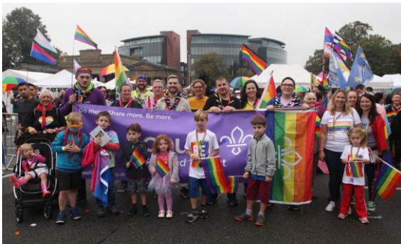
Supporting PRIDE 2019