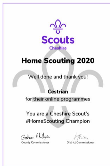
Home Scouting Certificate