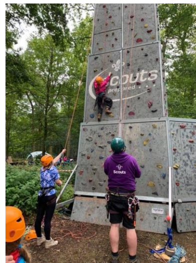
Climbing wall at District Camp 2019