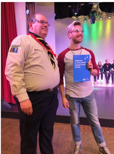
Wood Badge presentation