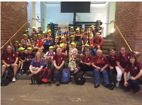
Group Day Trip to Liverpool