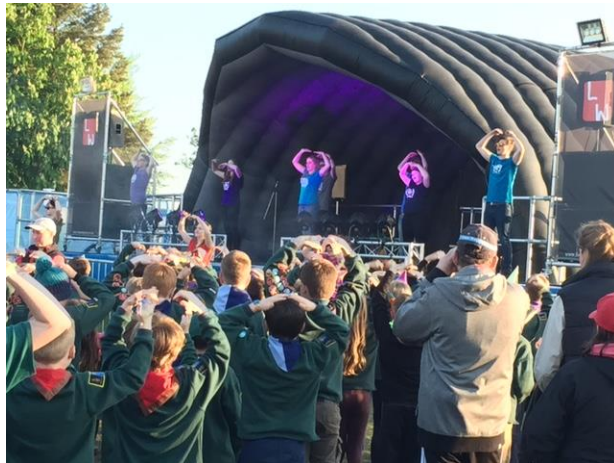
Cub100 Centenary Camp