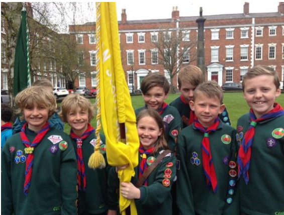
St Georges Day Parade