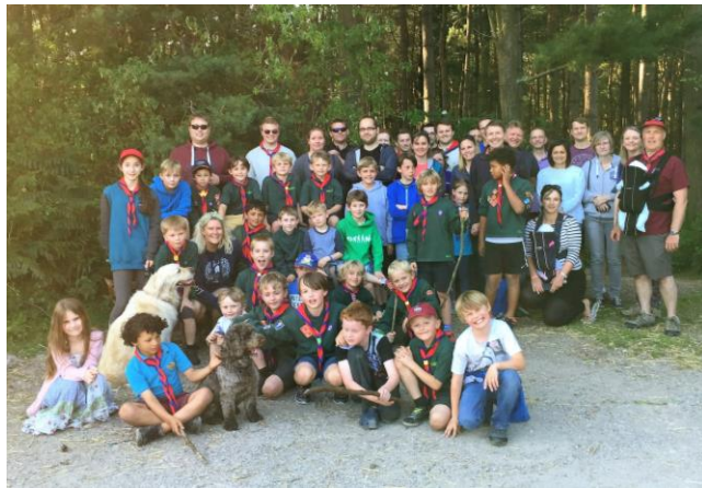
Delamere Cub family walk and picnic